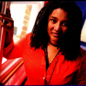
Photograph: Connor Kuykendall for the "Genius Grant"